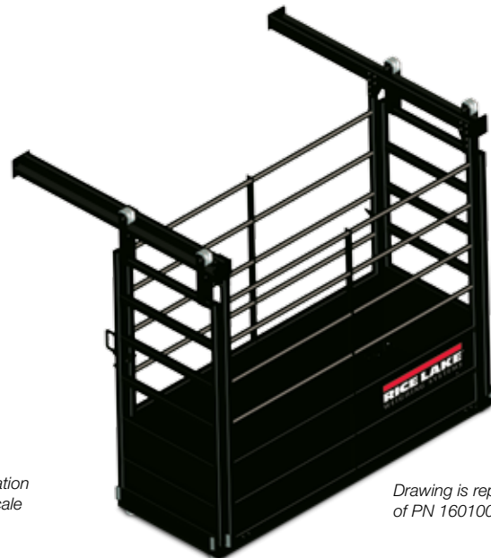
Drawing is representation of PN 160100 SLV scale

Your Rice Lake Weighing Systems distributor is: